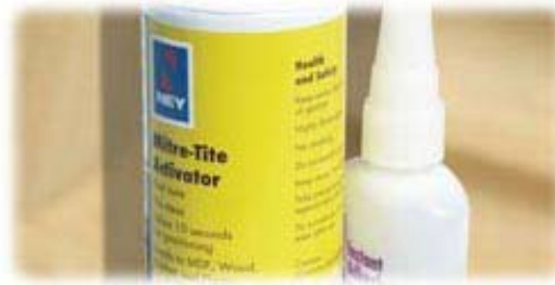
EVA Hotmelt Cartridges

Mitre-Tite two part contact adhesive kit comprises of a high viscosity instant adhesive and a cyanoacrylate activator. The simple application process (shown below) provides a quick method of bonding mitre joints in many different materials - in seconds.