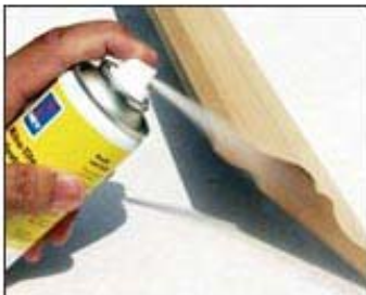
Spray one surface with activator