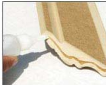
Apply adhesive to other surface