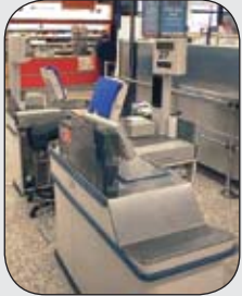
Ideal for checkouts