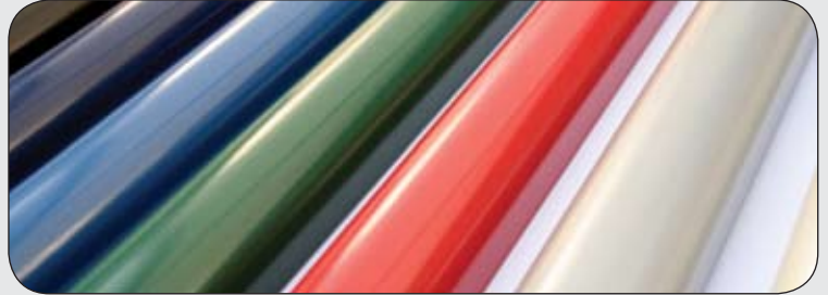
Available in a variety of stock colours - see table below