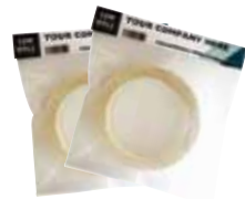
Packaging options available