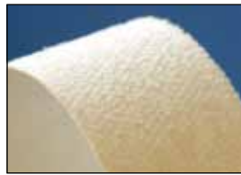
Can be applied pre-glued